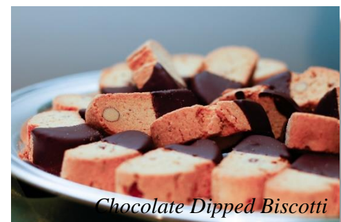
Chocolate Dipped Biscotti