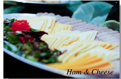
Ham & Cheese

Sweet potatoes, chicken sausage, and fresh herbs