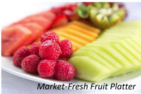
Market-Fresh Fruit Platter