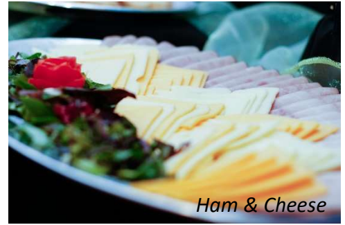
Ham & Cheese

Sweet potatoes, chicken sausage, and fresh herbs