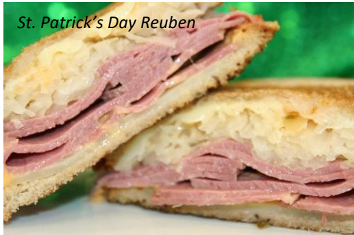
St. Patrick's Day Reuben