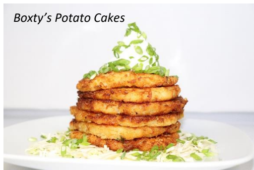
Boxty's Potato Cakes

Pan fried mashed and shredded potato cakes mixed with onions and aged cheddar. Served with sour cream and green onion ✓