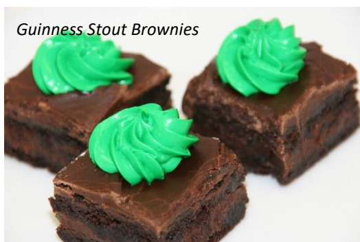
Guinness Stout Brownies

House-made mousse mixed with dark chocolate, mint, and Bailey’s Irish cream. Served in an edible chocolate cup ✓ GF