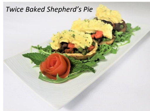
Twice Baked Shepherd's Pie

A delicious stout beer and cheddar cheese sauce served with hot Rye chips and sliced baguettes ✓