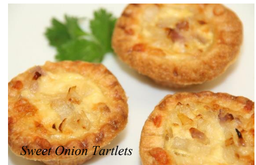
Sweet Onion Tartlets